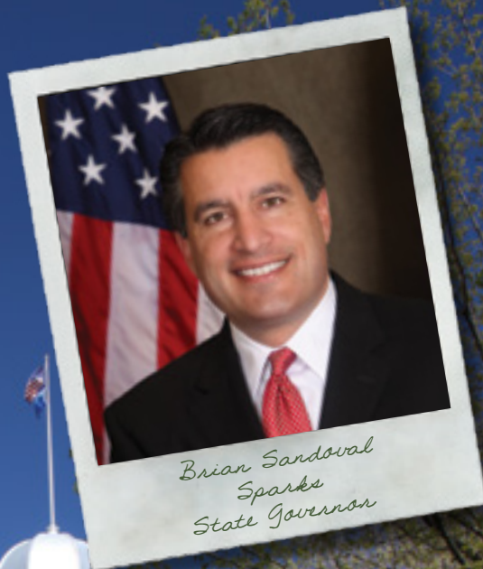
Brian Sandoval Sparks State Governor

Office of the Secretary of State 100 North Las Vegas Blvd., 8th Floor Las Vegas, NV 89101 Phone: (702) 498-2500